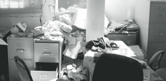
Office in Port-au-Prince following the earthquake.