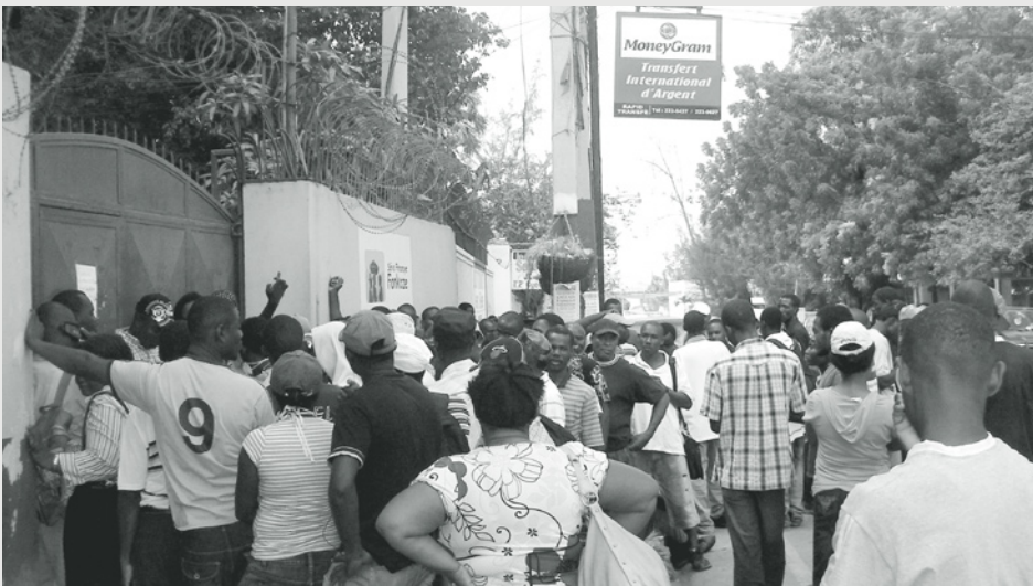
Haitian clients line up to withdraw savings and collect remittances sent from overseas.