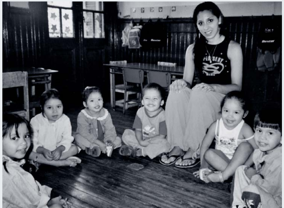
Fundamind (Buenos Aires, Argentina)